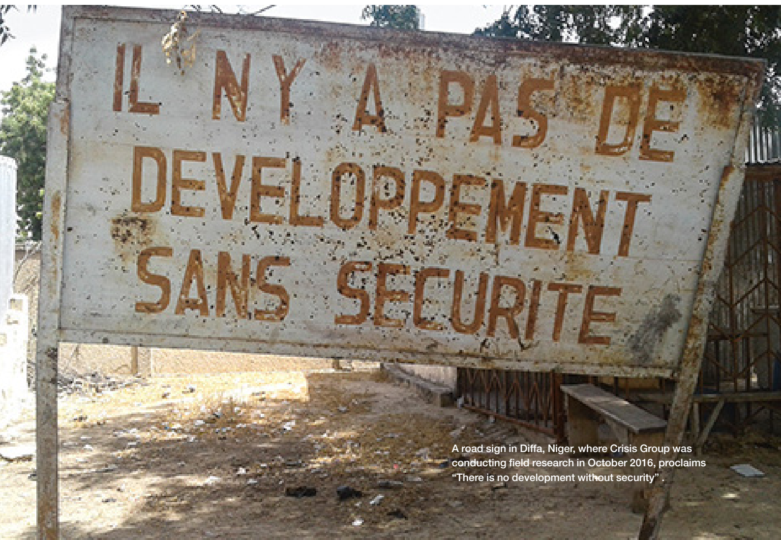
A road sign in Diffa, Niger, where Crisis Group was conducting field research in October 2016, proclaims “There is no development without security”.

President & CEO, International Crisis Group