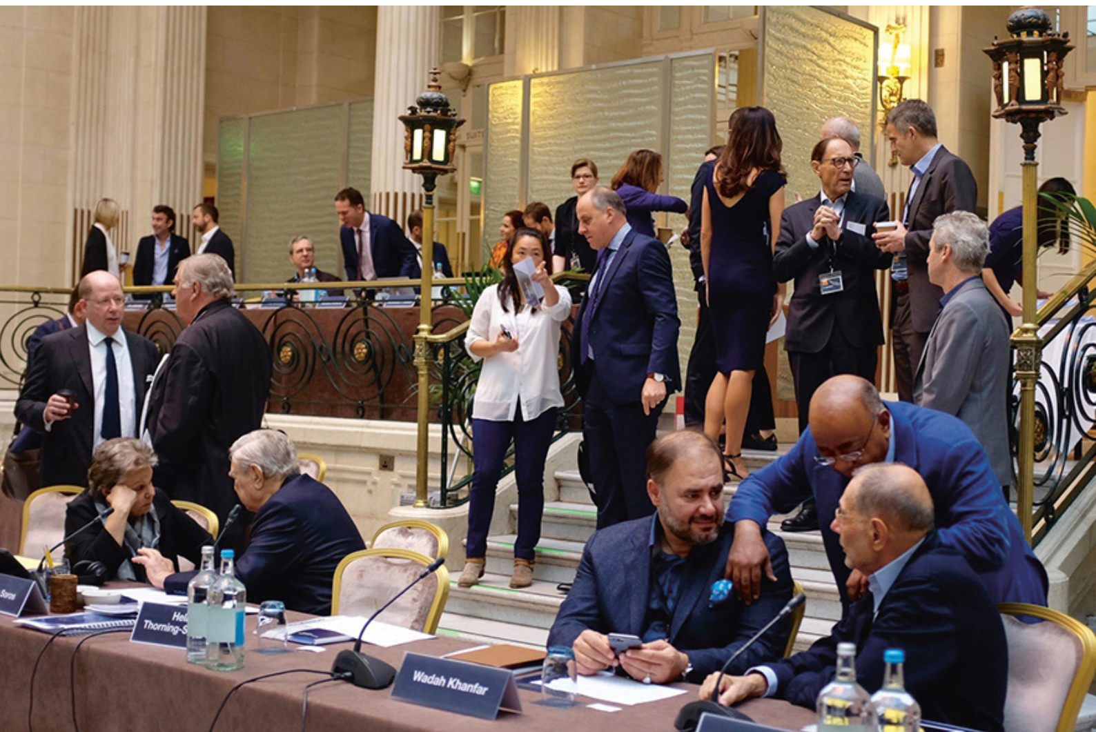
Board members and senior staff during a break in the Board Meeting in London, October 2016.

Co-Chair of the Board and former UN Deputy Secretary-General